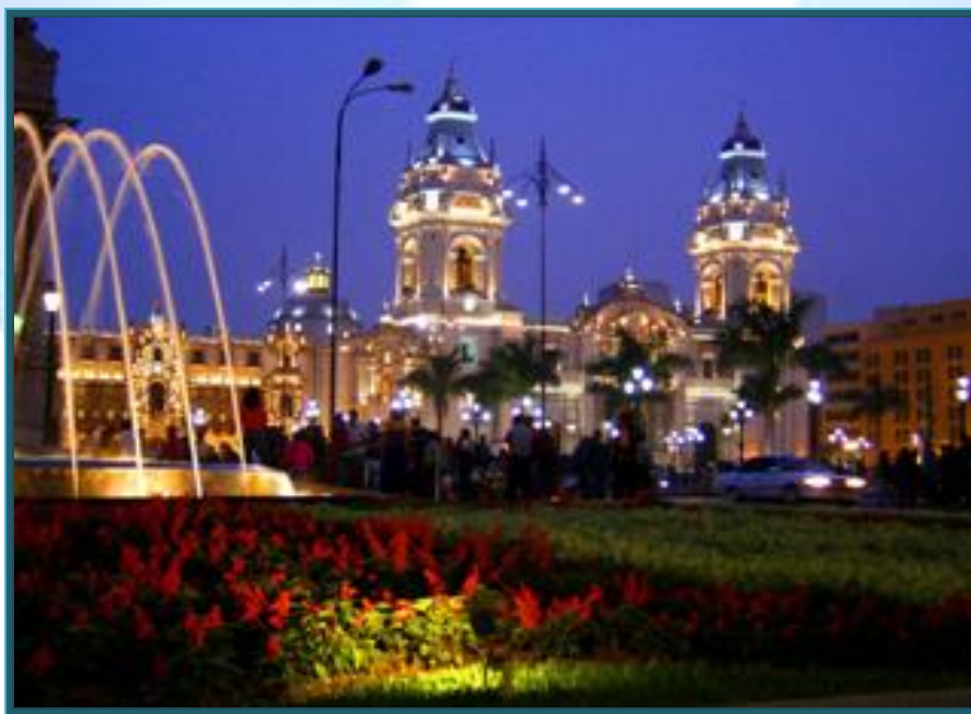
Lima's Main Square – Plaza De Armas