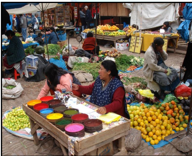
Sacred Valley Market

After breakfast in the hotel, fly to Cusco this morning (one hour flight) and enjoy the beautiful drive into the Sacred Valley of the Incas. We switch from Spanish Conquistadors to Incan and Quechua history. Arrive in the village of Pisac, drive directly to a traditional Incan restaurant and enjoy a traditional Peruvian lunch. This afternoon continue touring through this Incan Village known for its colorful outdoor handicraft and food market. Check-in to the hotel; Join the group for wine tasting prior to our included dinner at the hotel. B,L,D