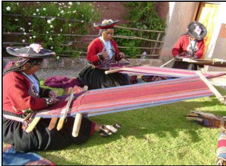
Weaving textiles in Chinchero

After a leisurely breakfast this morning, our return train departs back up the Valley to Ollantaytambo followed by the stunning drive to the Incan capitol of Cusco. In route to Cusco, stop in the historic village of Chinchero with its well preserved Incan wall in the main square. Enjoy lunch at a private residence and meet the owner of a small textile business. Check-in to 5-star Aranwa Hotel in Cusco, dinner is included at the hotel this evening or you're welcome to venture out on your own. B,L,D