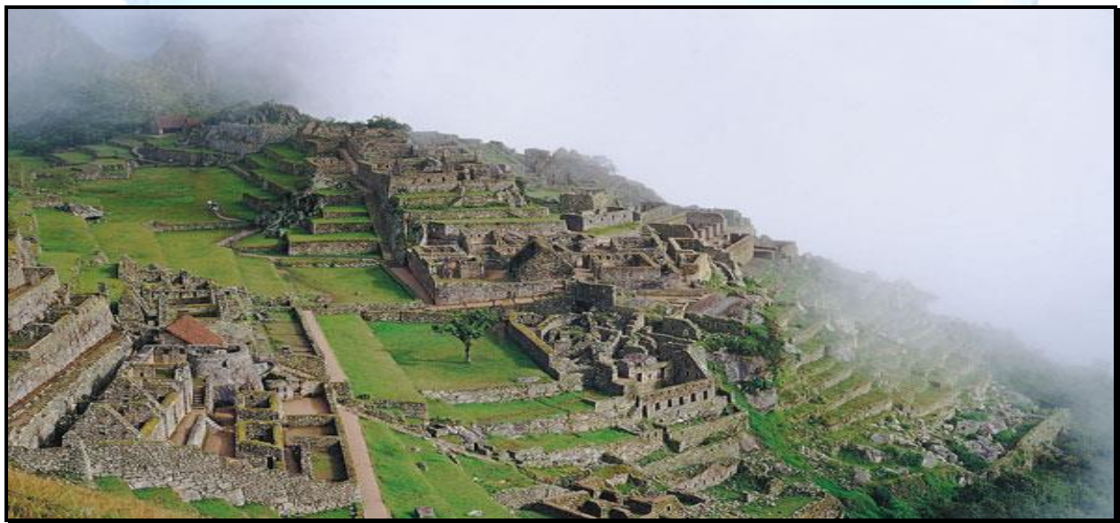
Mystical Machu Picchu

Following breakfast, we make our way up to the infamous Citadel of Machu Picchu. Our guide takes us on a complete educational and comprehensive tour through the ruins with ample time to view all corners of the once powerful Empire of the Americas. After an included lunch break, take the opportunity to explore the ruins on your own and hike to the Sun Gate or perhaps to the recently restored Inca Bridge. Both of these hikes will be guided as well. Perhaps you may like to sit and meditate by simply looking over the citadel in your own corner of the grounds and ponder one of history's great mysteries. Your evening is free to explore the tiny village of Aguas Calientes if desired. B,L,D