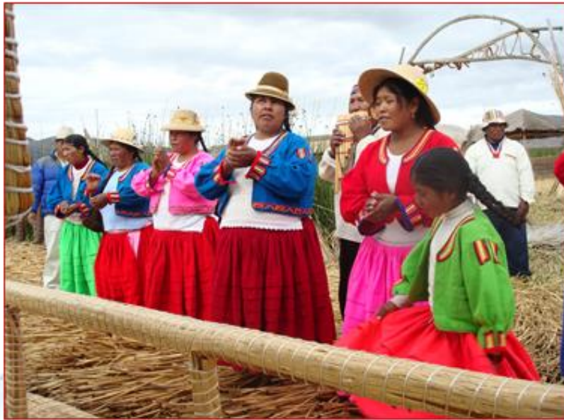
Women of Uros Island