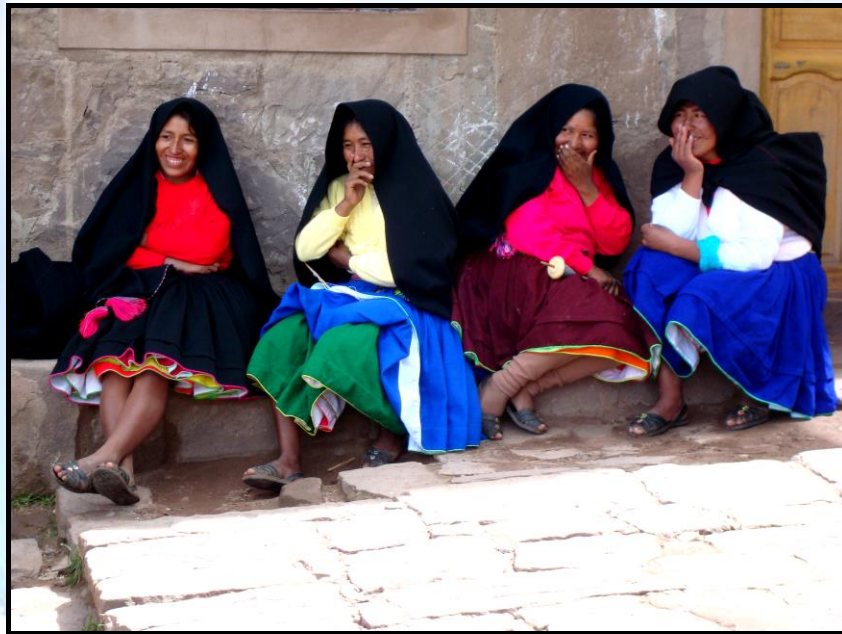
Taquile Island locals