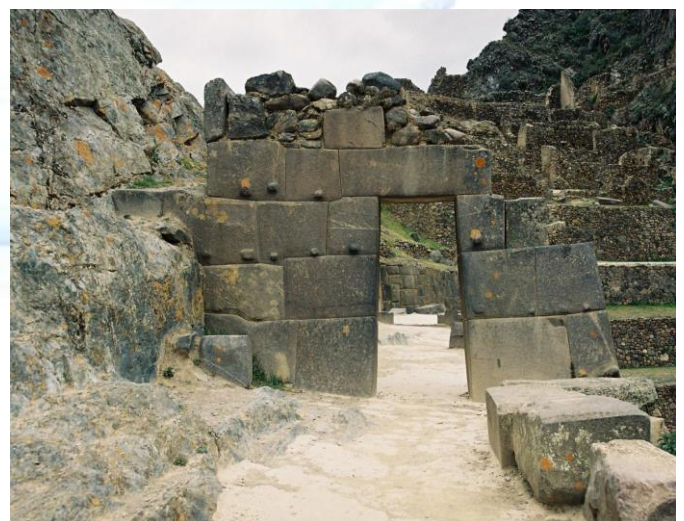
Stone doorway in Ollantaytambo